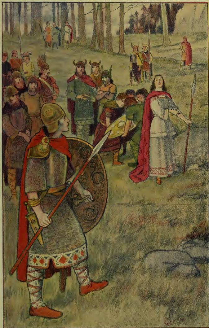
BRUNHILD AND GUNTHER.